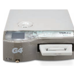
STAT/IM 2000 G4