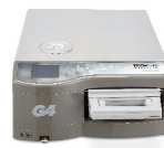
STAT/IM 5000 G4